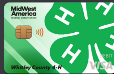
Whitley County 4-H