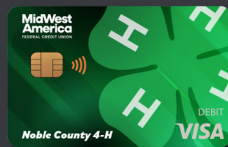
Noble County 4-H