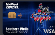
Southern Wells Community Schools