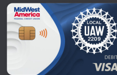
UAW Local 2209