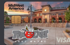
Fort Wayne TinCaps