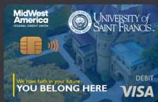
University of Saint Francis