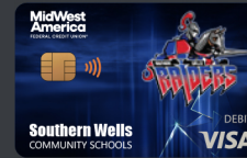
Southern Wells Community Schools