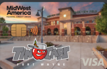
Fort Wayne TinCaps