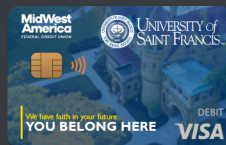
University of Saint Francis