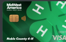
Noble County 4-H